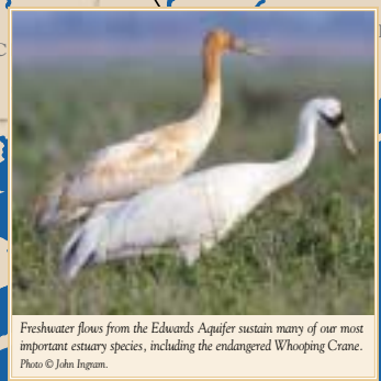
Freshwater flows from the Edwards Aquifer sustain many of our most important estuary species, including the endangered Whooping Crane.