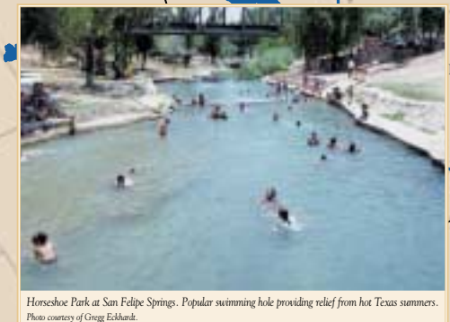
Horseshoe Park at San Felipe Springs. Popular swimming hole providing relief from hot Texas summers.