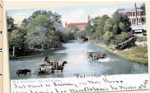
Postcard showing horse-drawn wagons crossing the San Antonio River, which no longer flows naturally. Water is now pumped out of the Edwards Aquifer to recreate stream flow.