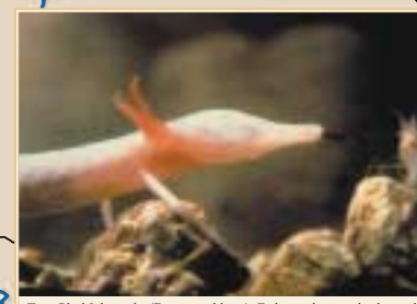
Texas Blind Salamander ( Eurycea rathbuni ). Endangered species that lives only in the Southern Edwards Aquifer.