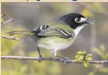
The endangered Black-Capped Vireo ( Vireo atricapillus ) is a small, migratory songbird that nests in Hill Country scrub every spring and summer.