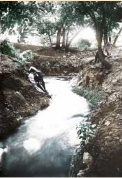
Couple enjoying the historic mill at Barton Springs in 1902.